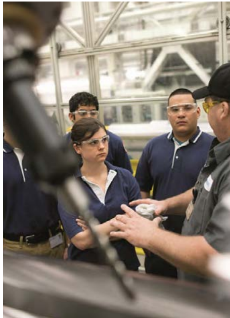
Apprentices at Siemens' gas turbine manufacturing facility in Charlotte, NC.

Can the RV Industry Learn from this experience? Maybe it's time.